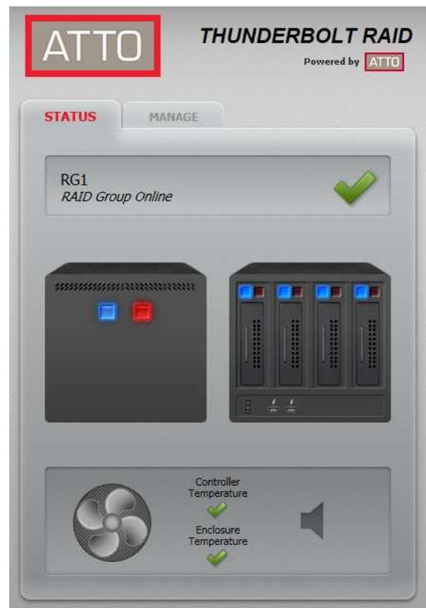
ATTOView™ Graphical User Interface